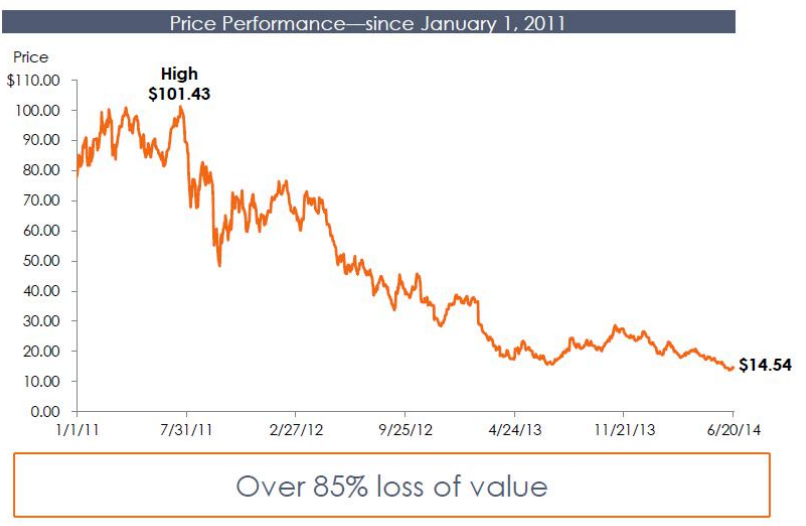
Note: Reflects closing price on June 20, 2014.

Casablanca's independent, knowledgeable and experienced Director nominees intend to guide Cliffs for the benefit of all shareholders. Casablanca urges all shareholders to vote their shares FOR Casablanca's independent nominees on the GOLD proxy card.